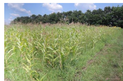
Figure 2: Organic comparative trial of corn populations at NARDI Fundulea